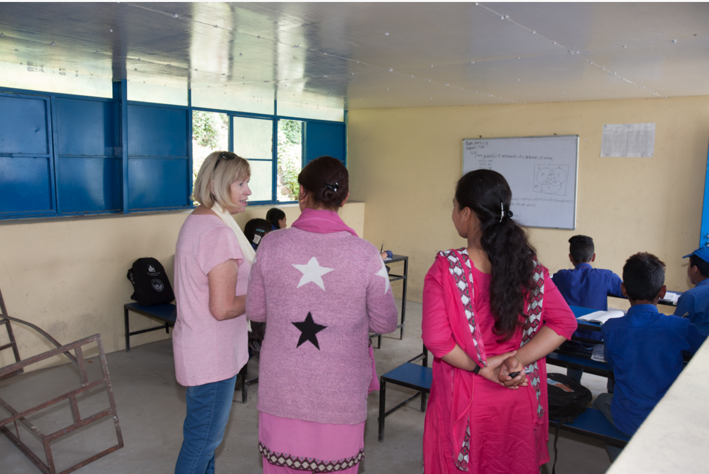
Sponsors Seti Devi School Visit April 2017