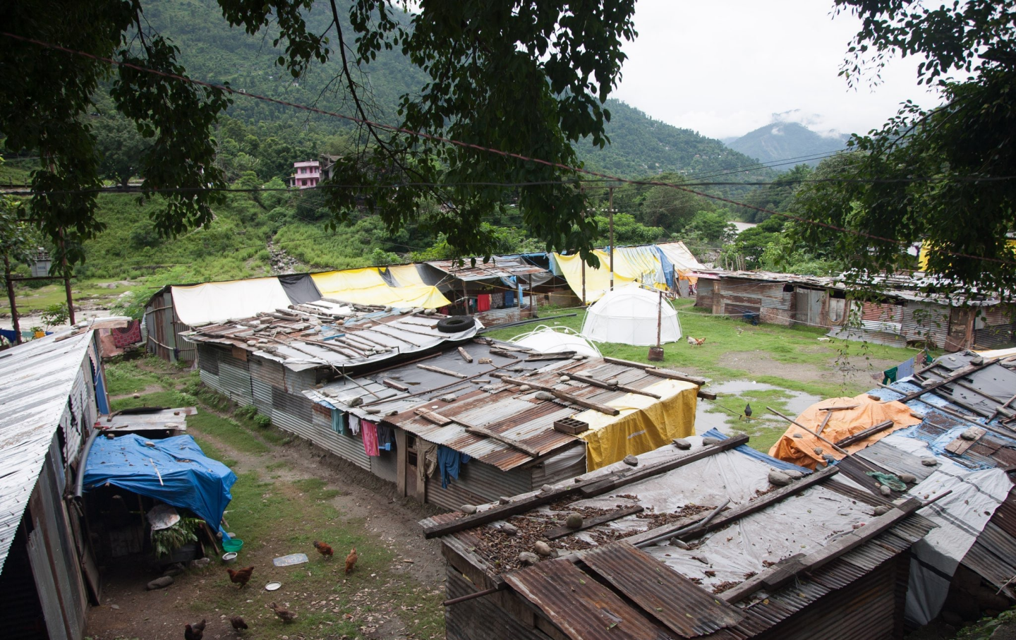
Many people living in makeshift housing