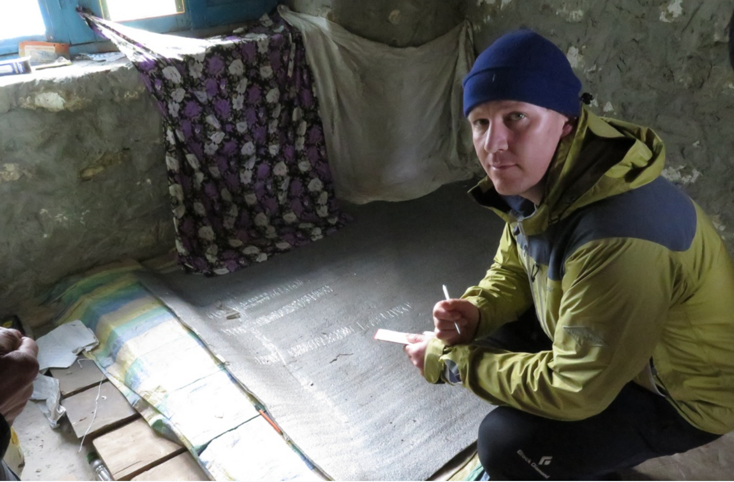
Ghunsa School room converted to “hostel” (visit 2013) 8 children slept on this one “mattress” (5mm foam) little supervision