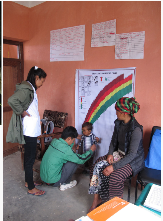
Out Reach Clinics and home visits – part of holistic medical support