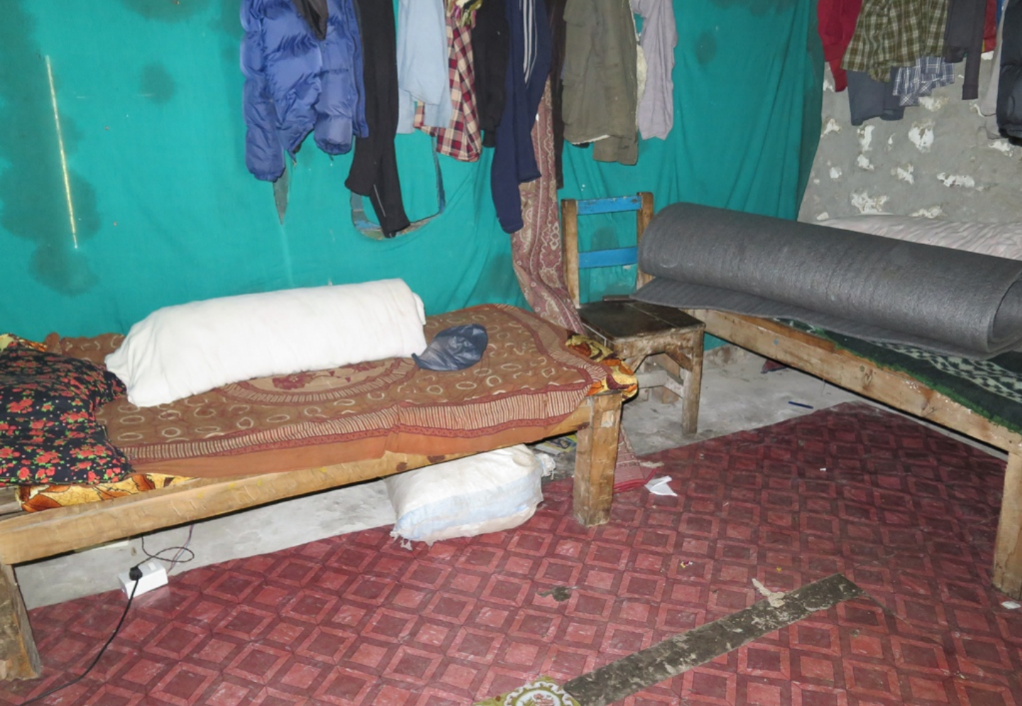
Teachers living at school in classroom (2013) – having to look after children 24x7