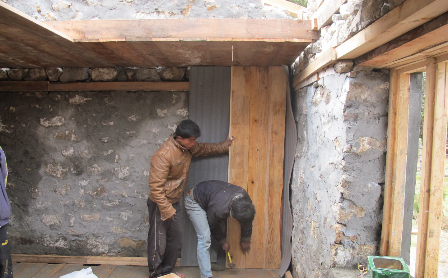
Rebuild classrooms warmer and more light