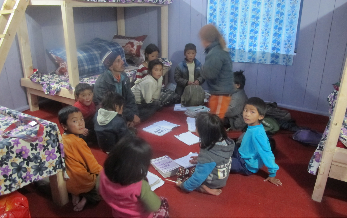
New hostel established July 2015 Teaching staff moved out to village accommodation