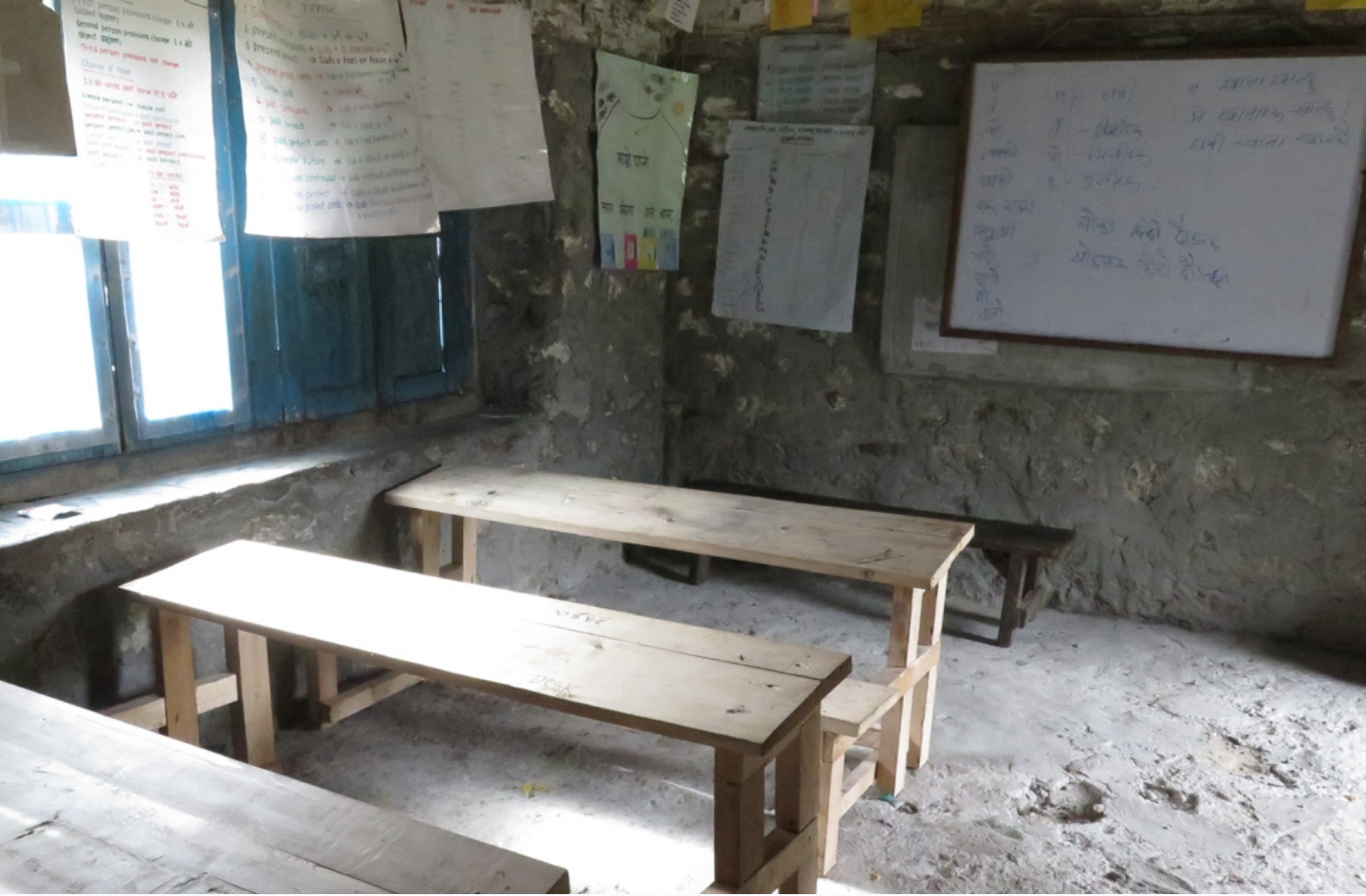
Ghunsa School Classrooms very cold and dark (2013) - most time spent outside...