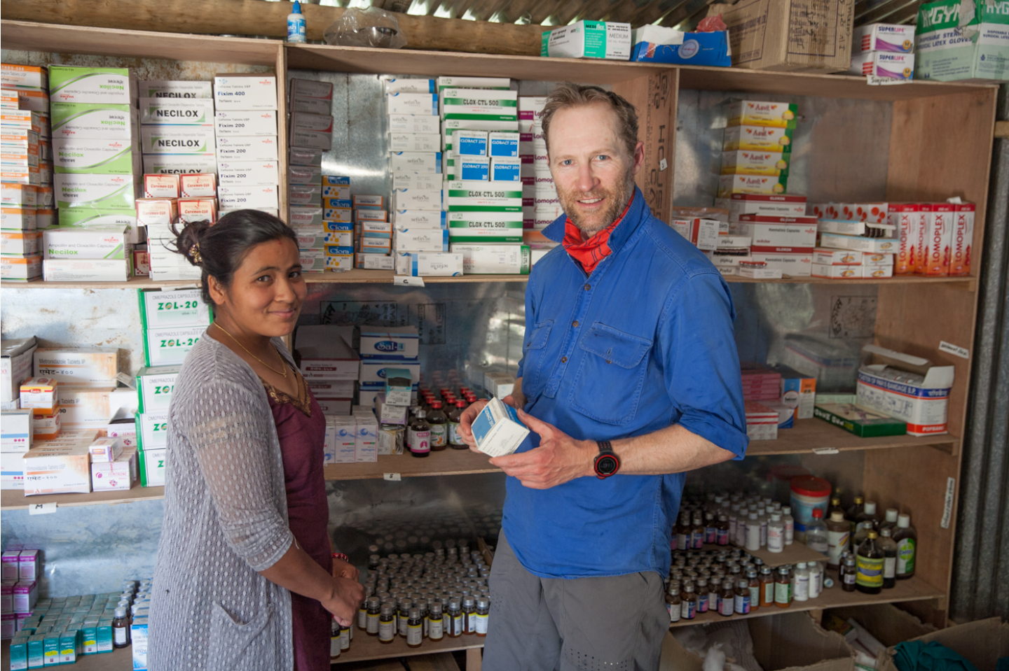
Balgoan Health Post (out reach clinic) operates $4 / consult, including medications