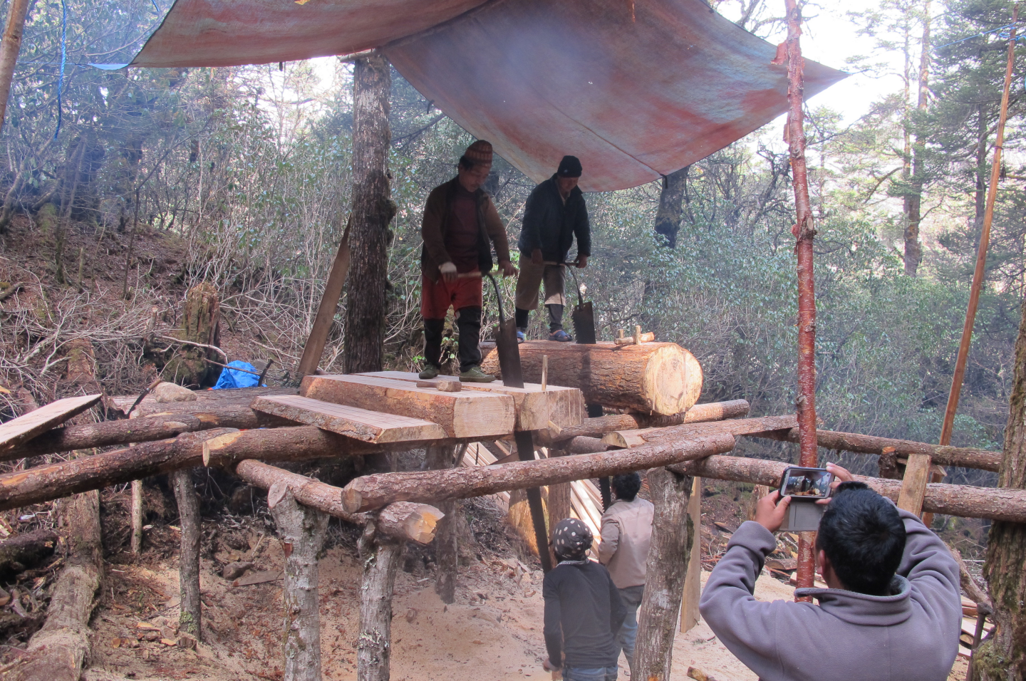
Local contribution of labour, materials and some cash