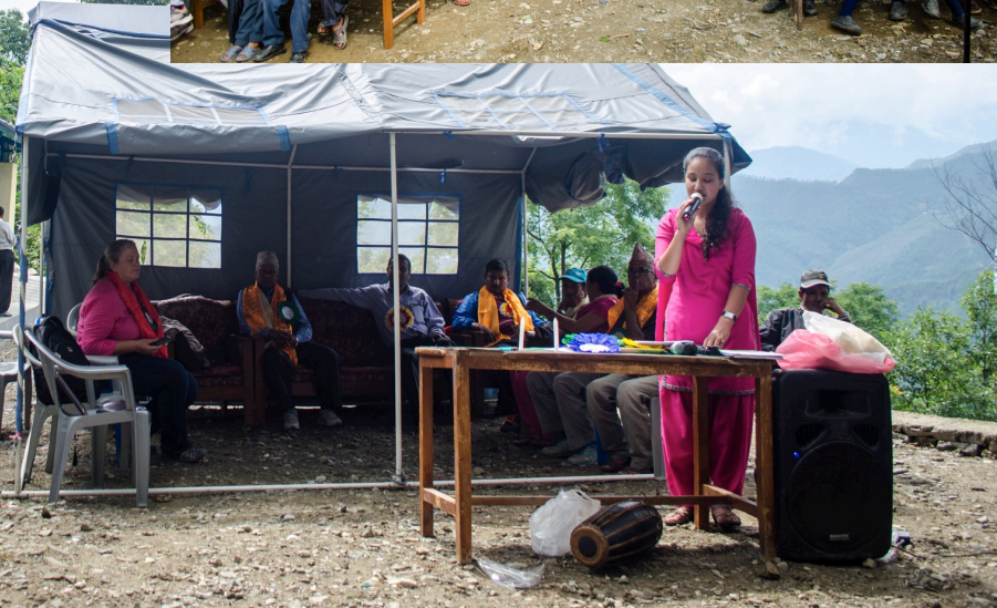
Seti Devi School opening of new classrooms sponsored by HDFA 2016 (no it's not the tent!)