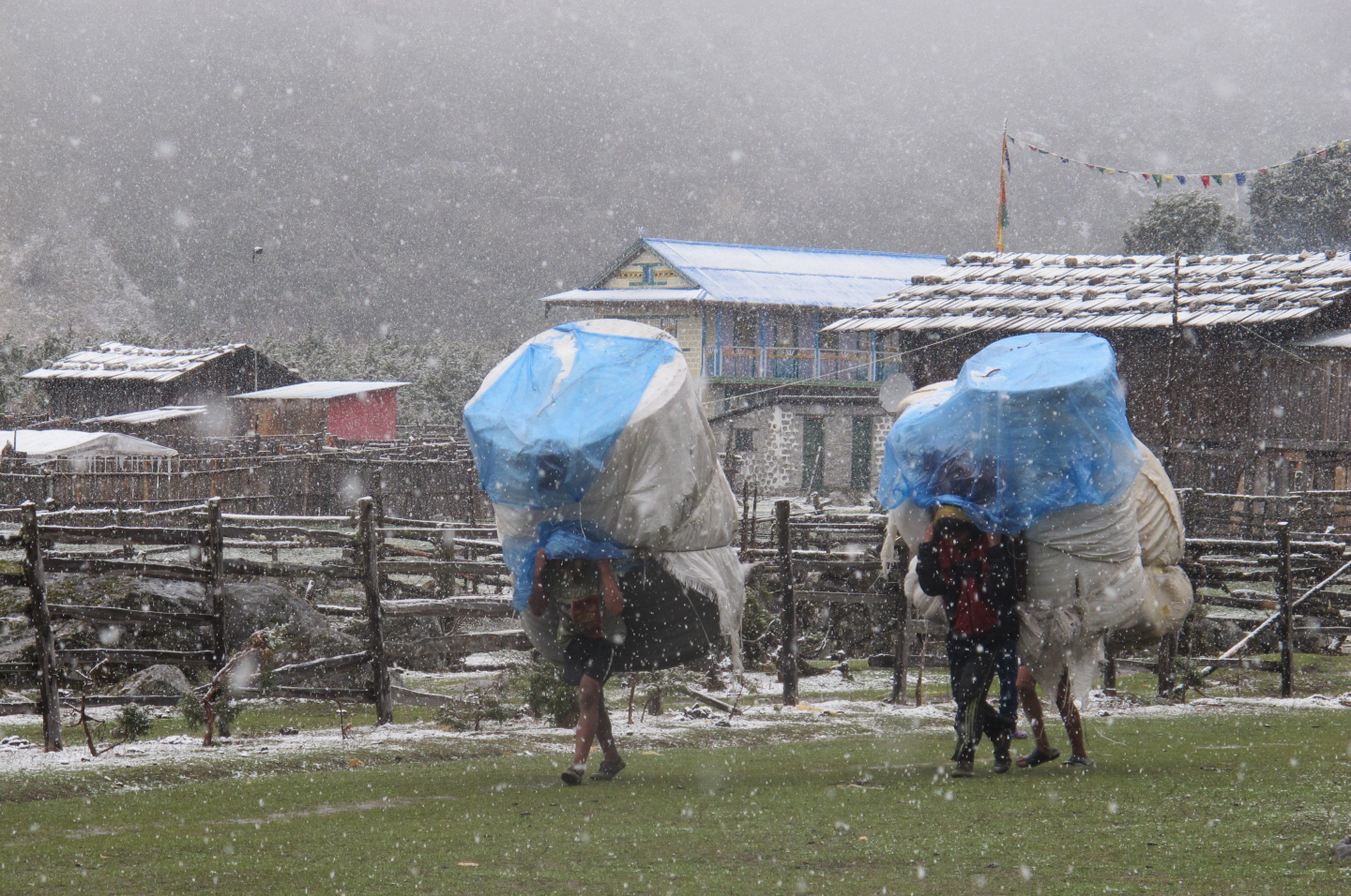
All materials carried in 5 days by porter to Ghunsa for rebuild