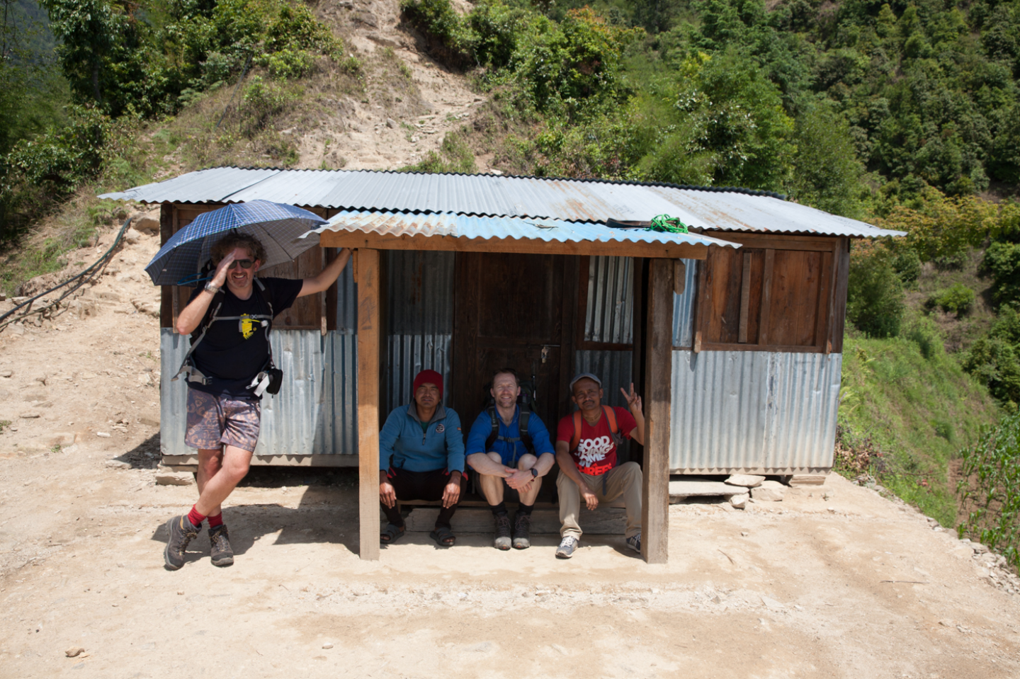
School for 24 children, 1 teacher - perched on side of a mountain – Board and Sponsors Visit May 2017