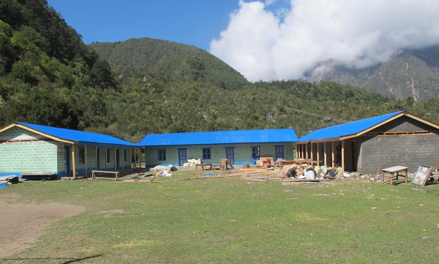
Ghunsa School - Kanchenjunga region totally rebuilt July 2015