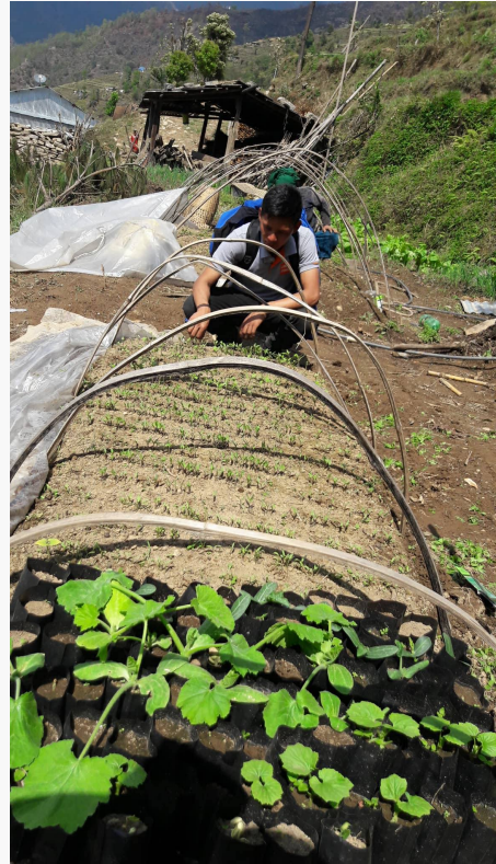
Livelihood training 2018 – agriculture improvement training